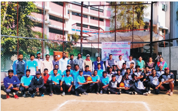
Successful organization of the Intercollegiate Men's Soft Ball Sports Competition at the college under Sant Gadge Baba Amravati University.