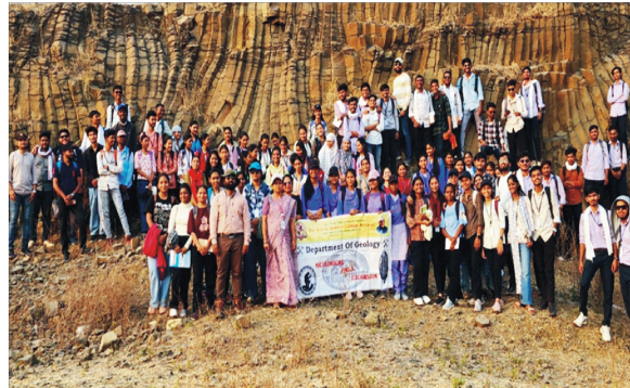
Geological Field Excursion at Wadgao Mahore – Super Columnar Structure by Dept. of Geology