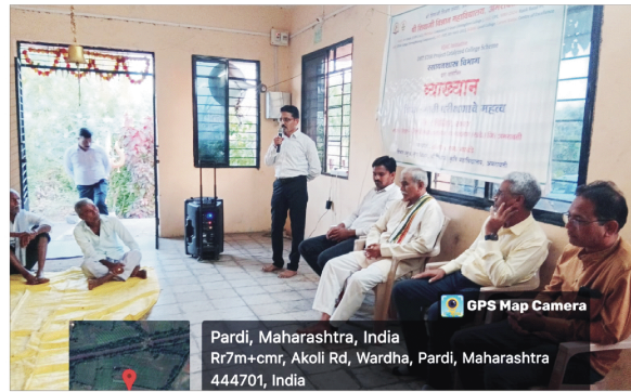
Pardi, Maharashtra, India Rr7m+cmr, Akoli Rd, Wardha, Pardi, Maharashtra 444701, India