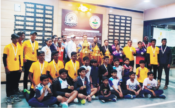
Three medals- Gold, Silver, and Bronze- won by the college's playground Softball teams across various age groups at the MP Sports Festival Cup held in Nagpur