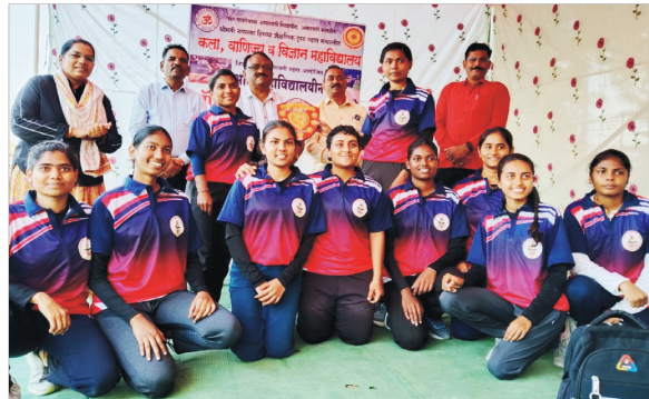
Gold medal won by the college women's team in the Intercollegiate Women's Softball Sports Competition organized by Sant Gadge Baba Amravati University.