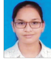
VEERA D. BAND 89.33 %