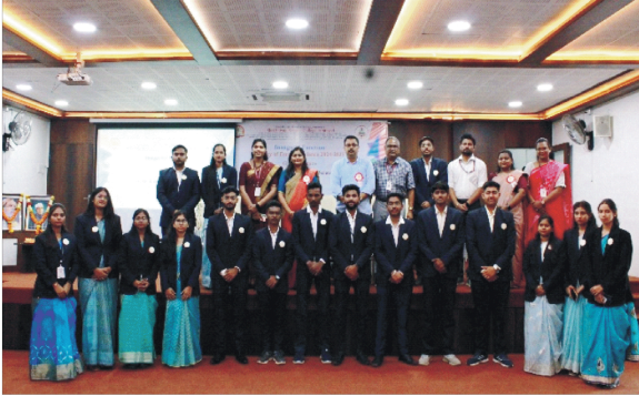
Cyber Security Workshop by Dept. of Forensic Science