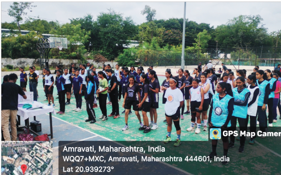
Successful organization of the Intercollegiate Women's Basketball Sports Competition at the college under Sant Gadge Baba Amravati University.