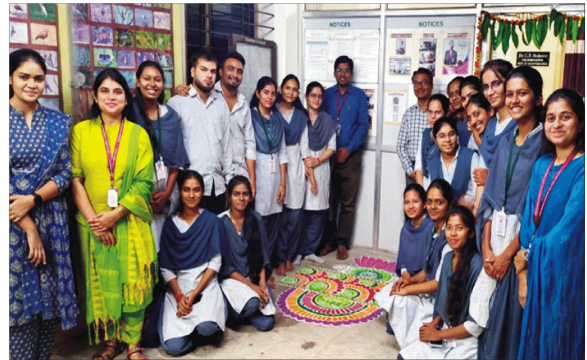
Diwali Celebrations at P. G. Department of Bioinformatics