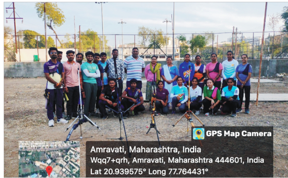
Successful organization of the Intercollegiate Fencing (Boys and Girls) Sports Competition at the college under Sant Gadge Baba Amravati University.