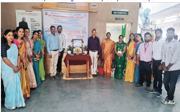
Poster and Model Competition and Exhibition by Mathematics Dept.