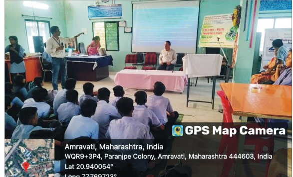
E-waste awareness drive in school by Dept. of Env. Sci.