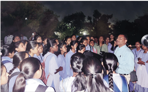
Sky Watching Activity by Dept. of Physics