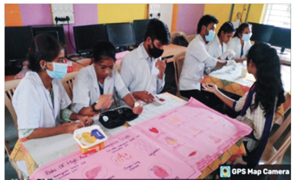
Blood Grouping Activity at Ganeshdas Rathi High School & Shivaji Multi High School, Amravati by Dept. of Microbiology