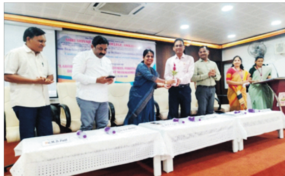
DBT Star Activity by Dept. of Life Sciences