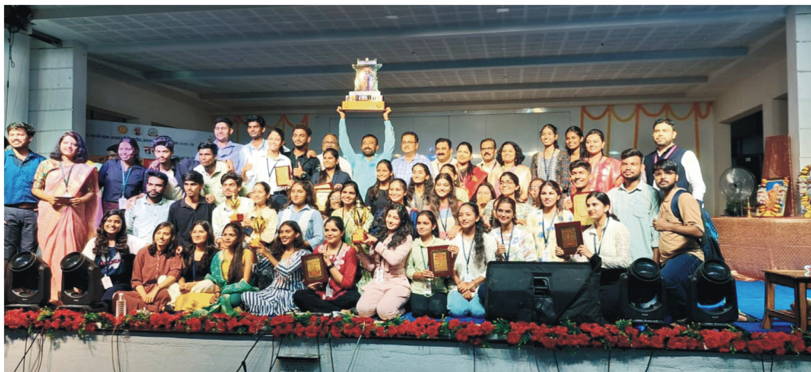
University Championship Trophy - SGBAU Youth Festival-2024