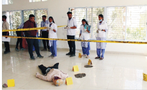
Trace to Truth 2025 (Science Day Celebration) by Dept. of Forensic Science