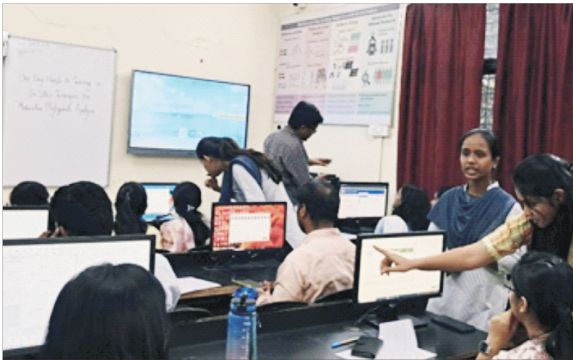
One Day Hands-on Training on In-Silico Techniques for Molecular Phylogenetic Analysis by Dept. of Bioinformatics