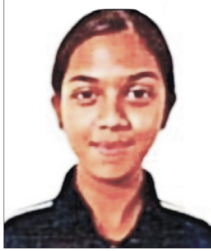
Tejasvini Vighne Soft Ball : Gold Medal National Level