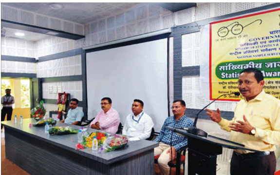
Guest lecture on Statistical Awareness conducted by Ministry of Statistics & Programme Implementation