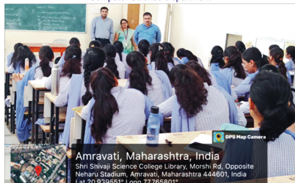
Amravati, Maharashtra, India Shri Shivaji Science College Library, Morshi Rd, Opposite Neharu Stadium, Amravati, Maharashtra 444601, India Lat 20.939551° Long 77.765801°