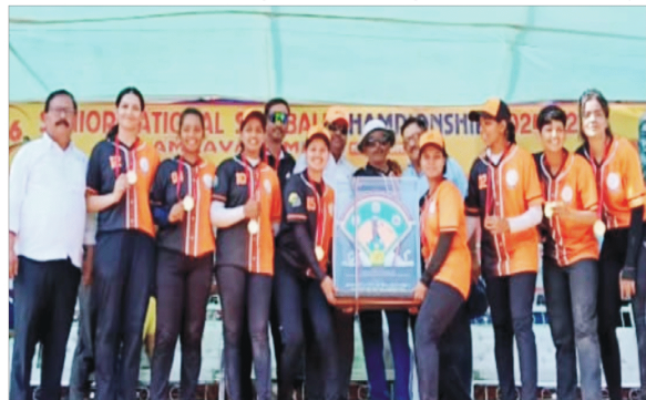
Soft Ball Sports Competition Winner Team of the College