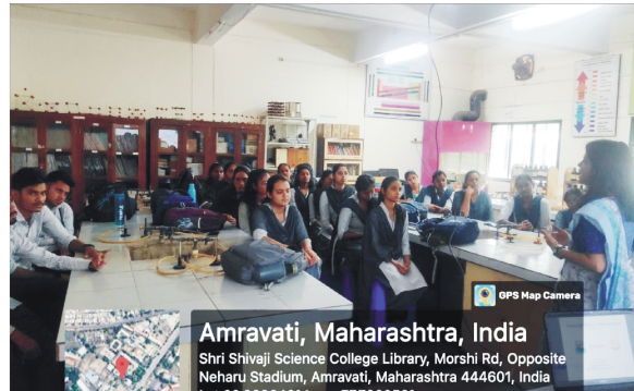
Amravati, Maharashtra, India Shri Shivaji Science College Library, Morshi Rd, Opposite Neharu Stadium, Amravati, Maharashtra 444601, India