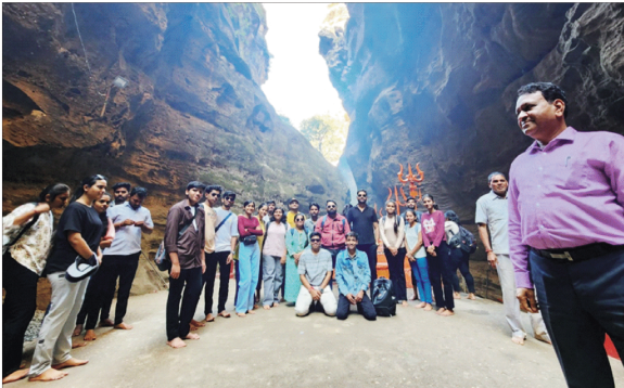
Geological Field Excursion at Pachmarhi by Dept. of Geology