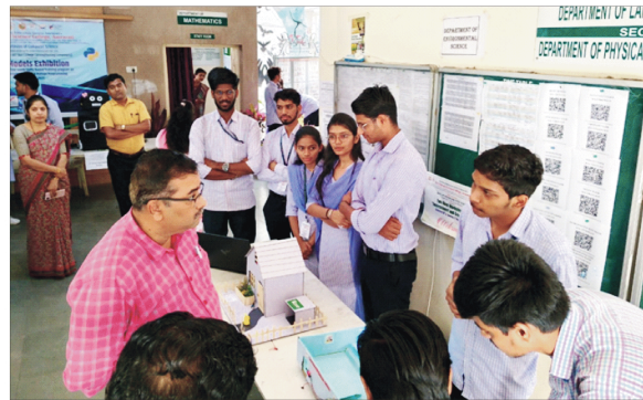
Exhibition of IoT Models developed by students of Computer Science Department