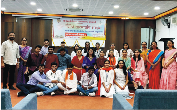
'Marathi Bhasha Din' program by Dept. of Languages on 27 th Feb. 2025