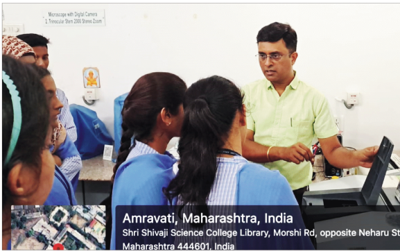
Amravati, Maharashtra, India Shri Shivaji Science College Library, Morshi Rd, opposite Neharu St Maharashtra 444601, India