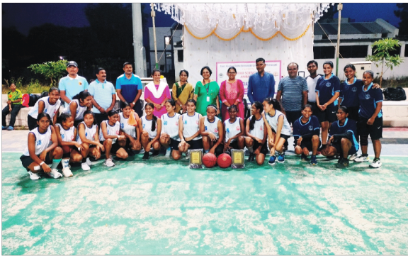
Prize distribution ceremony along with winners and runners-up of the Intercollegiate Basketball Sports Competition.