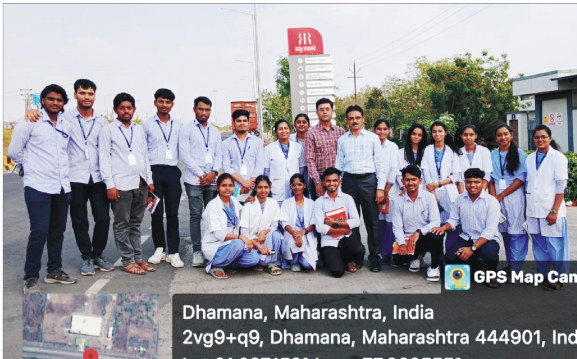
Dhamana, Maharashtra, India 2vg9+q9, Dhamana, Maharashtra 444901, India