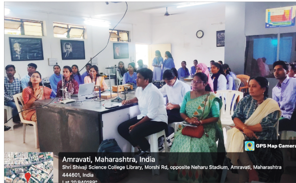
Hands-on Workshop on Integrating Technology by Dept. of Physics