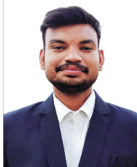
TEJAS DIVE (MIMICRY)