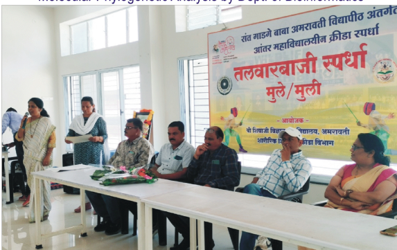
Fencing Competition organized by Dept. of Physical Education & Sports