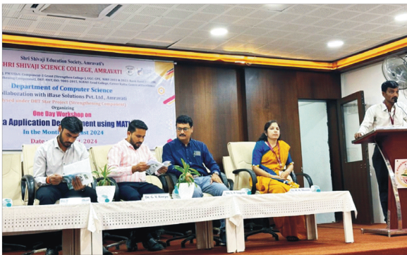
DBT Star Activity: One Day Workshop on Big Data Application Development using MATLAB by Computer Sci. Dept.