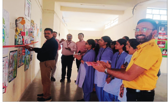
The Hon'ble Principal inaugurating Poster Making Competition by Dept. of Languages