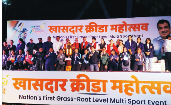
Nation's First Grass-Root Level Multi Sport Event