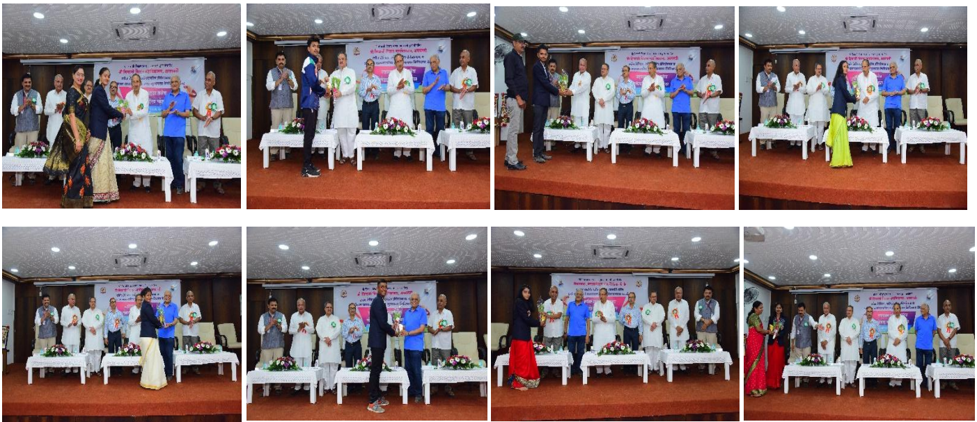
Organization of 29 softball senior state tournament 8 to 10 6-2022